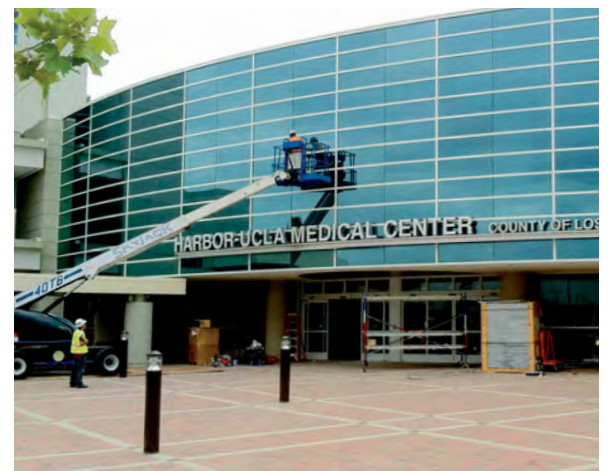
Finishing touches are put on the new Surgery Emergency Replacement Project at Harbor-UCLA Medical Center.