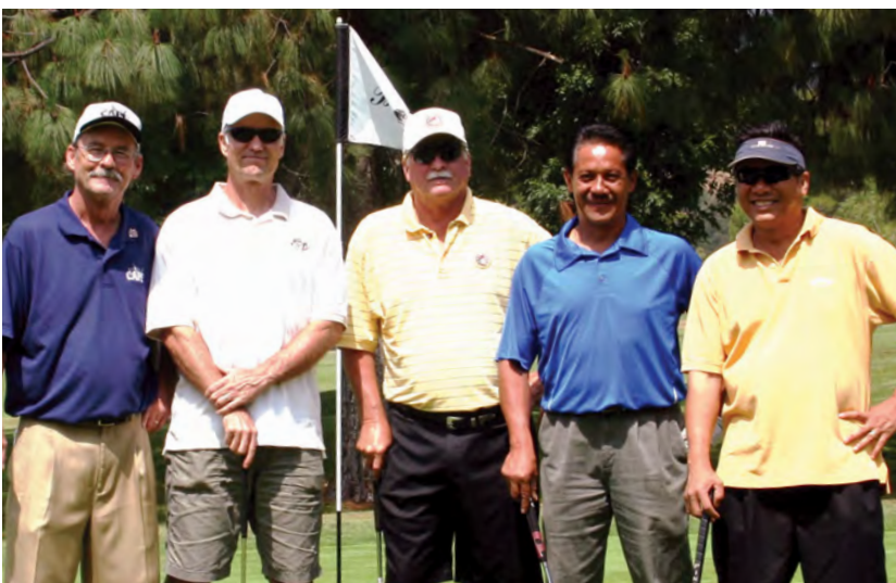
The 2nd Annual CAPE Golf Tournament was held on Friday, June 7, 2013, and it was a big success! Thanks to the many CAPE members and friends who joined us.